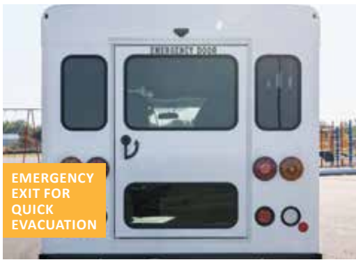
EMERGENCY EXIT FOR QUICK EVACUATION