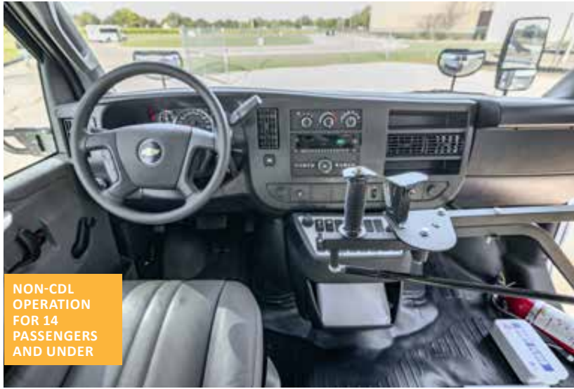
NON-CDL OPERATION FOR 14 PASSENGERS AND UNDER