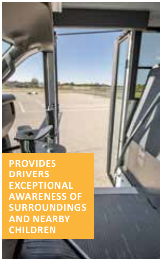
PROVIDES DRIVERS EXCEPTIONAL AWARENESS OF SURROUNDINGS AND NEARBY CHILDREN