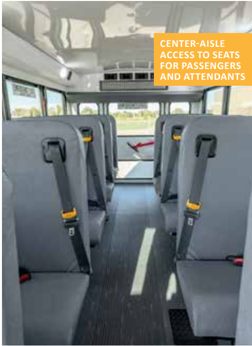
CENTER-AISLE ACCESS TO SEATS FOR PASSENGERS AND ATTENDANTS