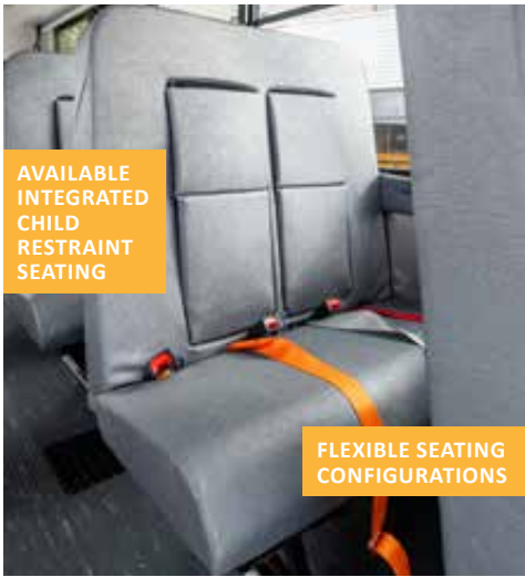
AVAILABLE INTEGRATED CHILD RESTRAINT SEATING