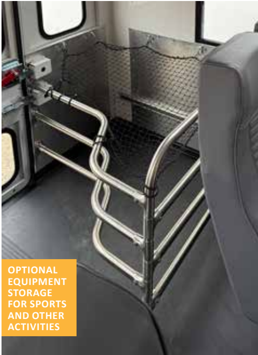
OPTIONAL EQUIPMENT STORAGE FOR SPORTS AND OTHER ACTIVITIES