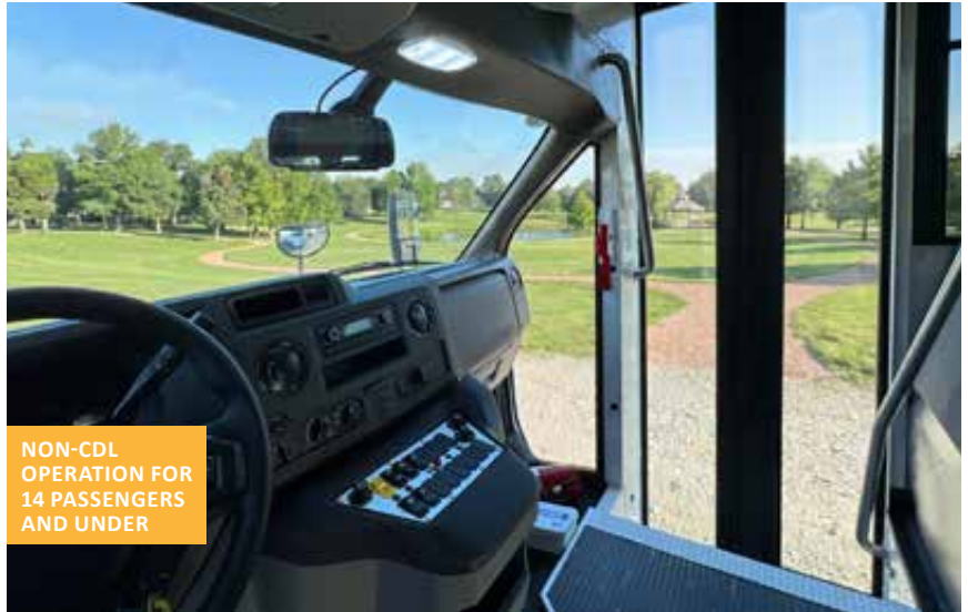
NON-CDL OPERATION FOR 14 PASSENGERS AND UNDER