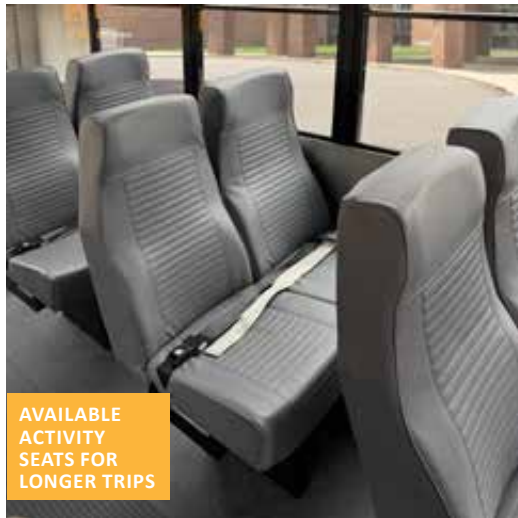
AVAILABLE ACTIVITY SEATS FOR LONGER TRIPS