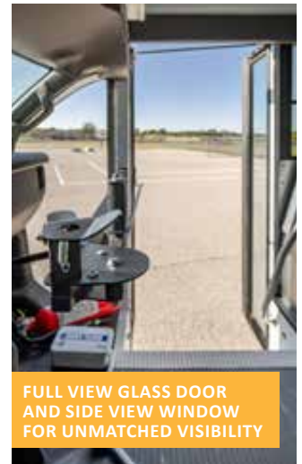
FULL VIEW GLASS DOOR AND SIDE VIEW WINDOW FOR UNMATCHED VISIBILITY